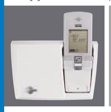
Handset with mains powered recharging base

Handset with battery powered recharging base