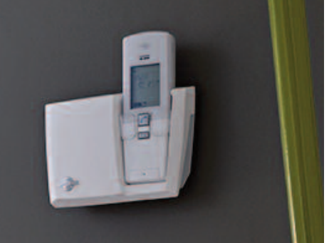
Control box with internal antenna

Wall mounted handset with lithium battery power pack base (mains not required)